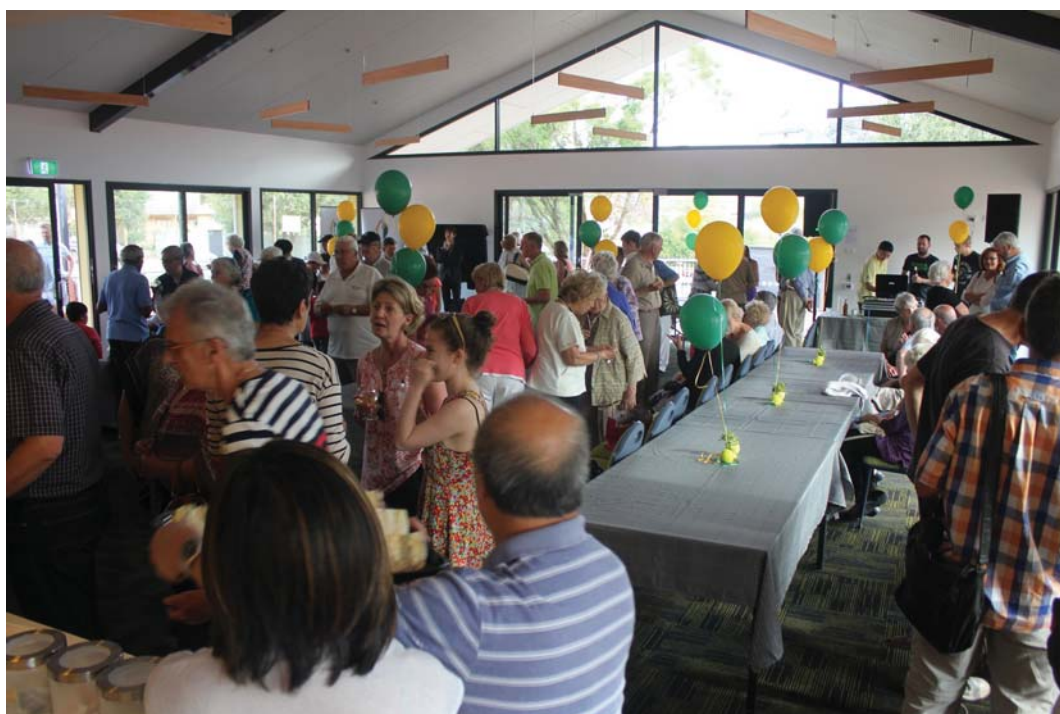
Members enjoying the new clubroom