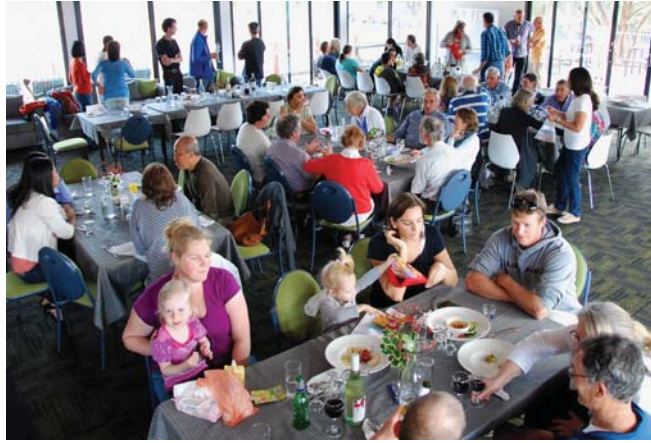
In full swing