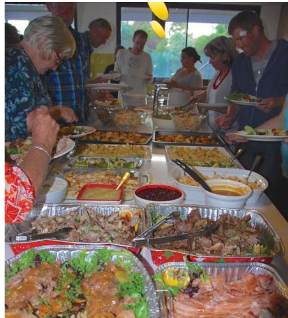
The delicious array of food