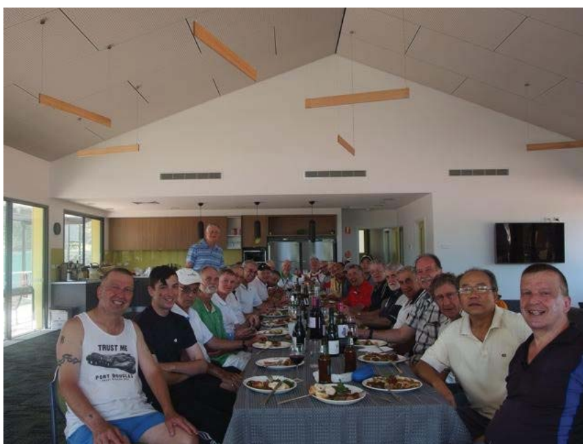
The long table