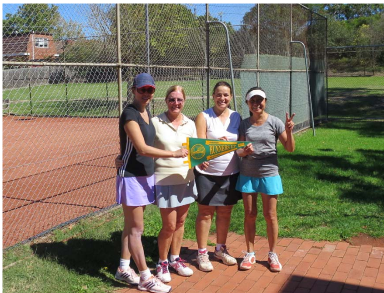
Tuesday Ladies MEMRLTA – Section 3