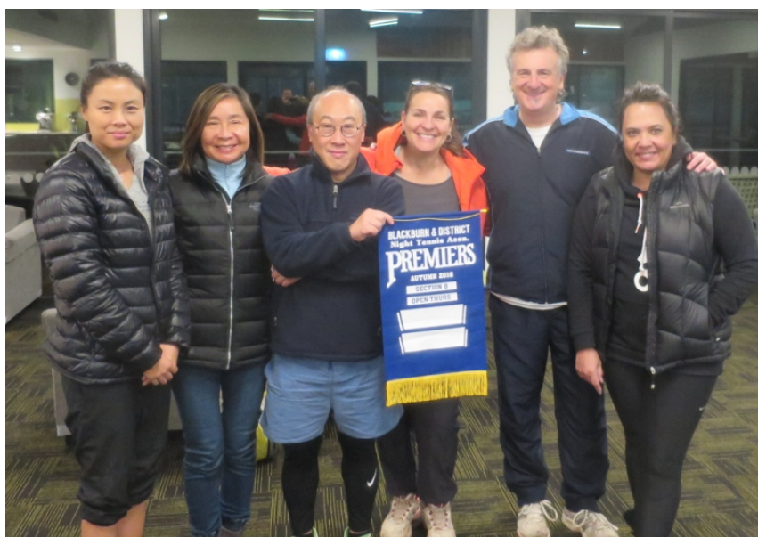
Thursday Open Section 8 North Balwyn Ad Ins