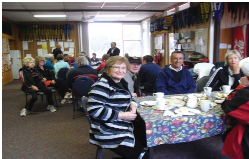
Seniors Tennis Victoria Round Robin

Thirty-five people attended and all 8 courts were used. The weather was DRY and no wind, perfect for tennis. This was the second year NBTC has hosted this event and it is expected to continue to do so in coming years.